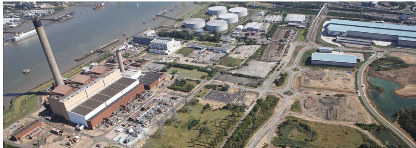
Dartford - London

Bericote is a niche commercial developer, specialising in occupier led development and the promotion and development of large, strategic sites around the UK. Working with the best in the industry to transform brownfield and infill sites to accommodate state-of-the-art logistic facilities.